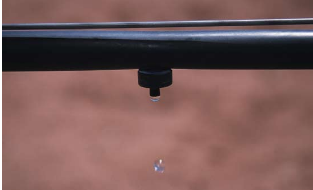
Drip irrigation systems allow water to be applied to individual plants, thereby reducing evaporation.