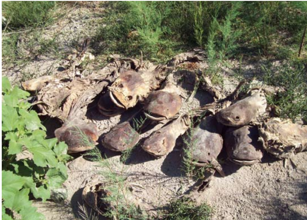
Low water levels caused the death of these fish in O.C. Fisher Lake near San Angelo.

Water-based recreation, such as fishing and boating, is also impacted by declining water levels. This is significant in a state that ranks second nationally in angler days and sixth for number of boats registered for use. 16 Low water levels in lakes, rivers and streams impede recreation, as many boat ramps close when water levels decrease and algal blooms disrupt opportunities to fish. 17 The drought has measurably reduced outdoor recreation by Texans: visitor fees paid at Texas state